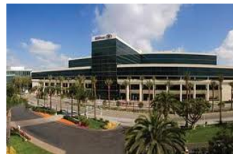
Exhibit Hall Location: Palos Verdes AB 777 Convention Way Anaheim, CA 92802

Parking will be covered by the OC Symposium. Please be sure to park in the self parking lot to receive complimentary parking.